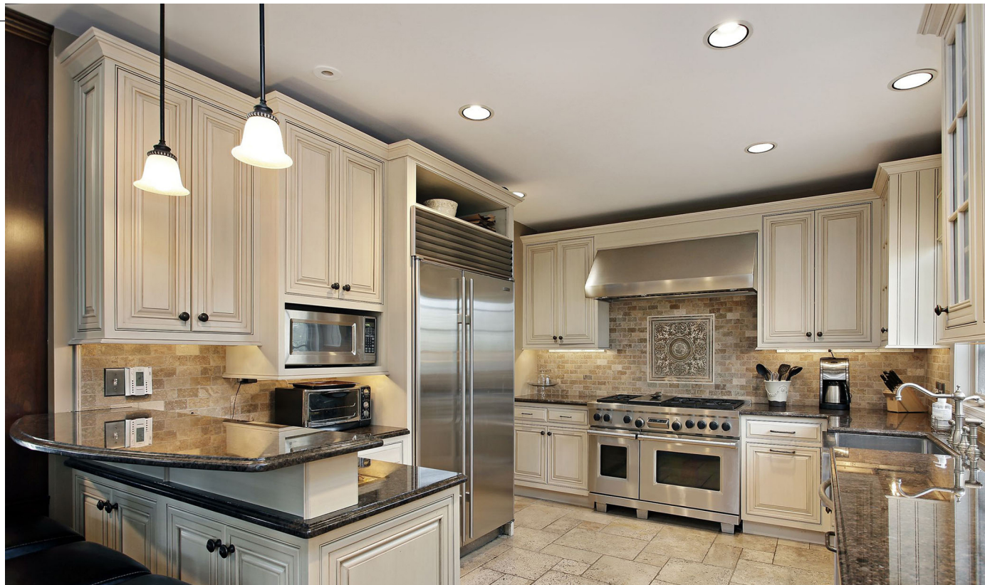
273 Cooper Drive, Just Sold!