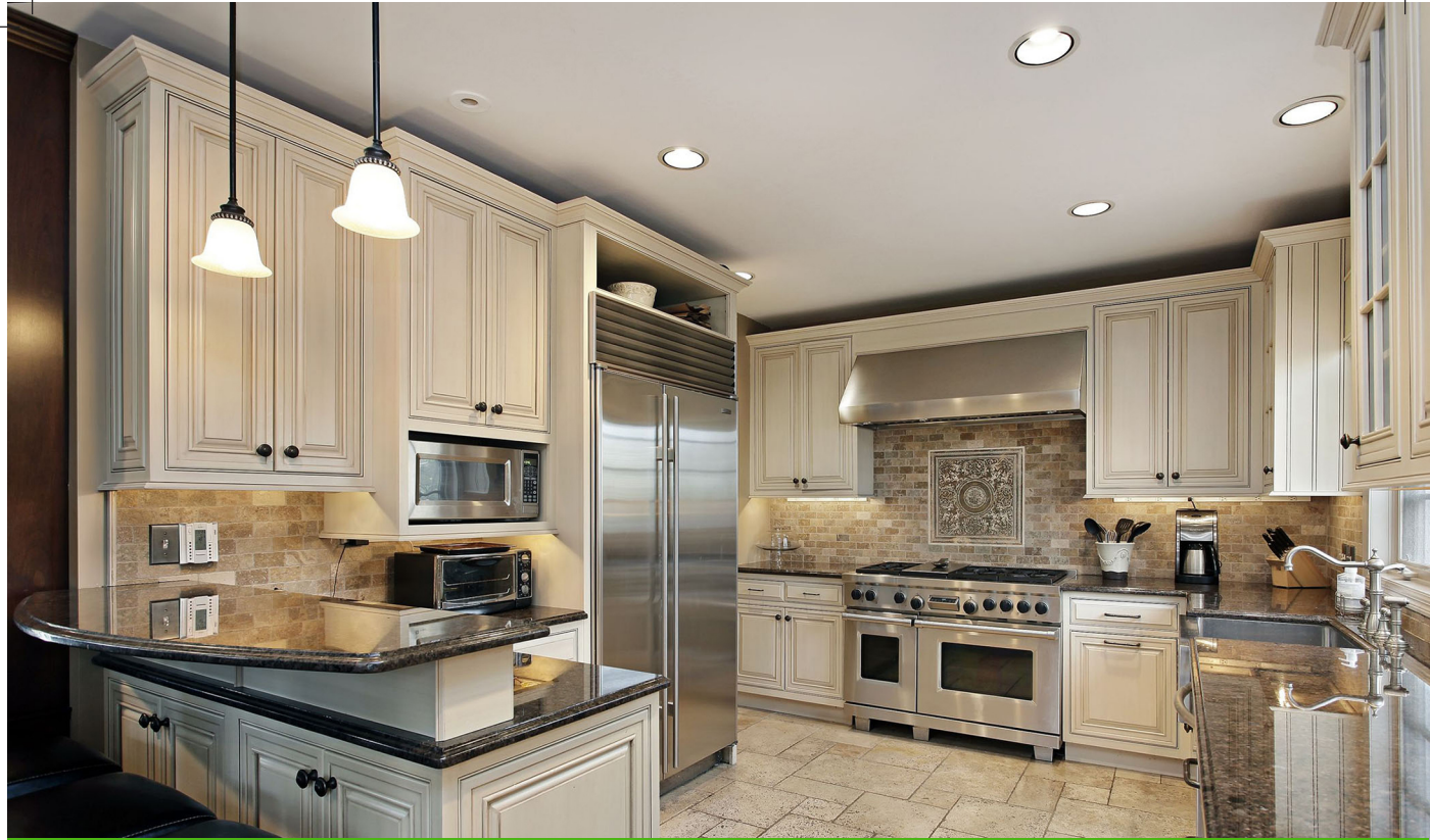
273 Cooper Drive, Just Sold!