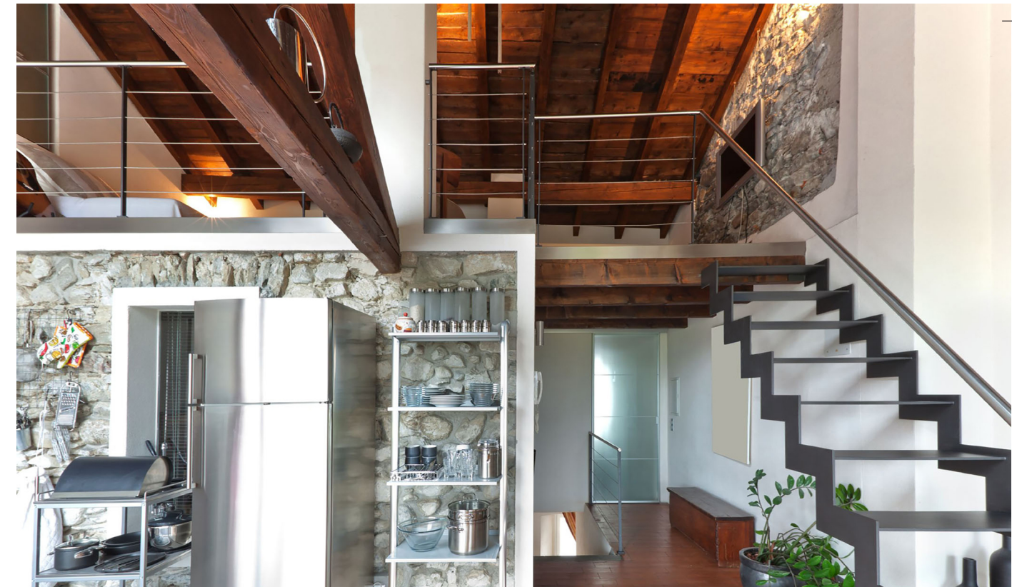
1536 Russell Way , Just Sold!