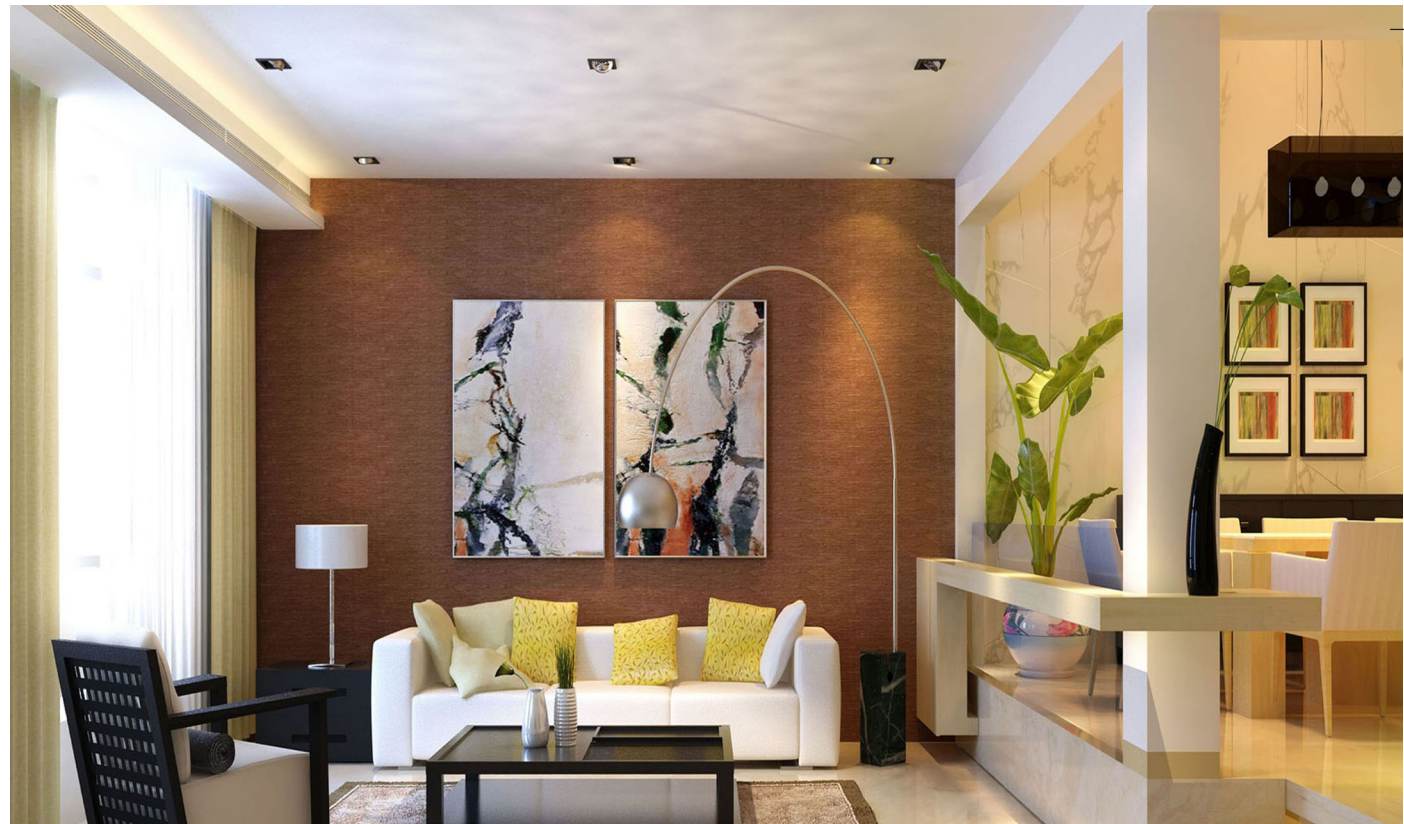
807 Jefferson Drive, Just Sold!