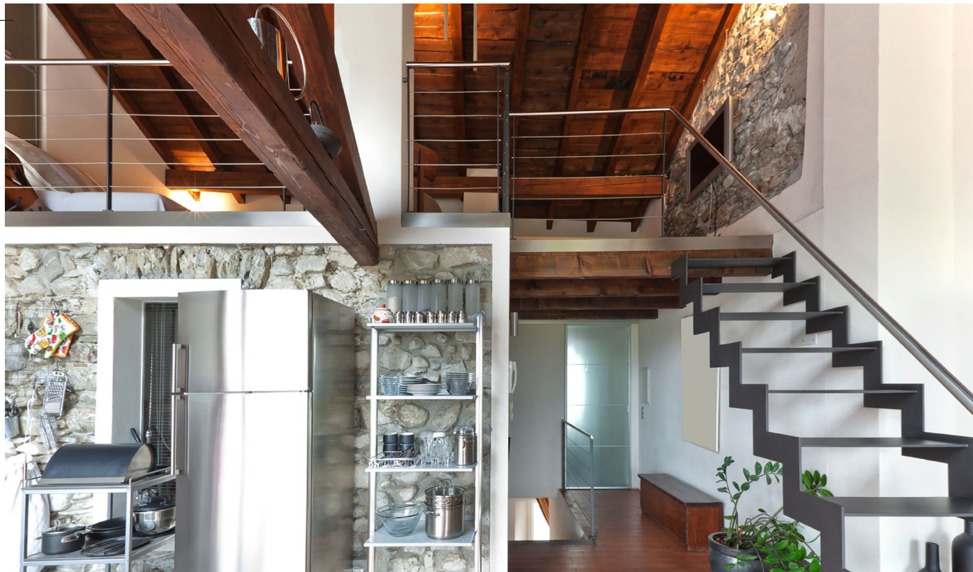
1536 Russell Way , Just Sold!