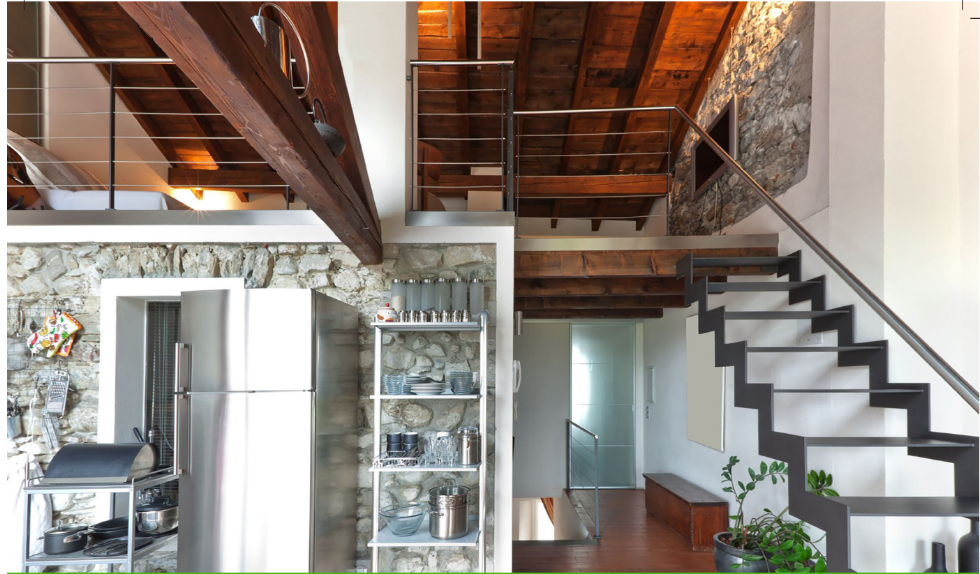
1536 Russell Way , Just Sold!