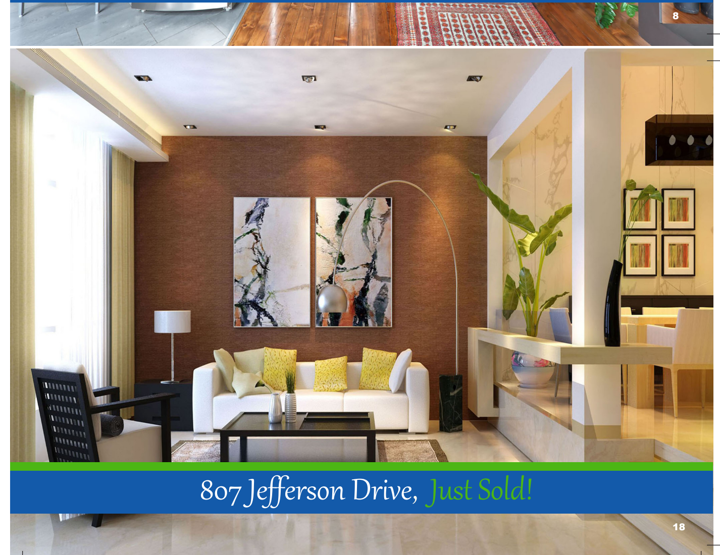
807 Jefferson Drive, Just Sold!