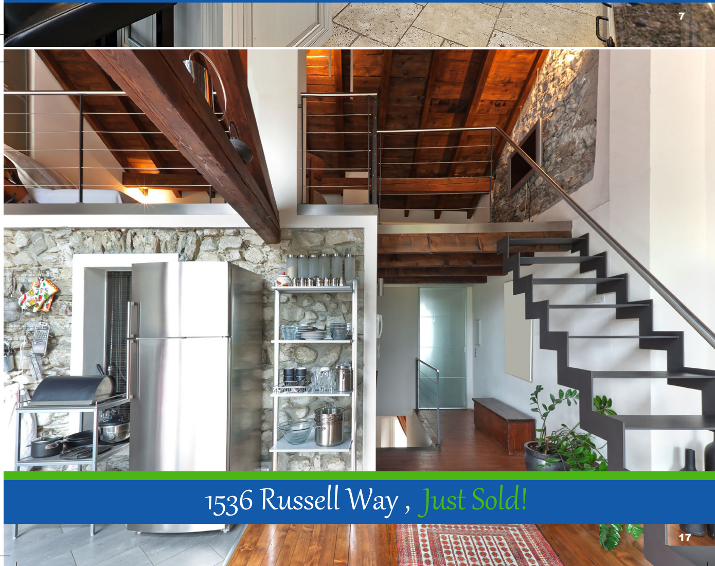
1536 Russell Way, Just Sold!